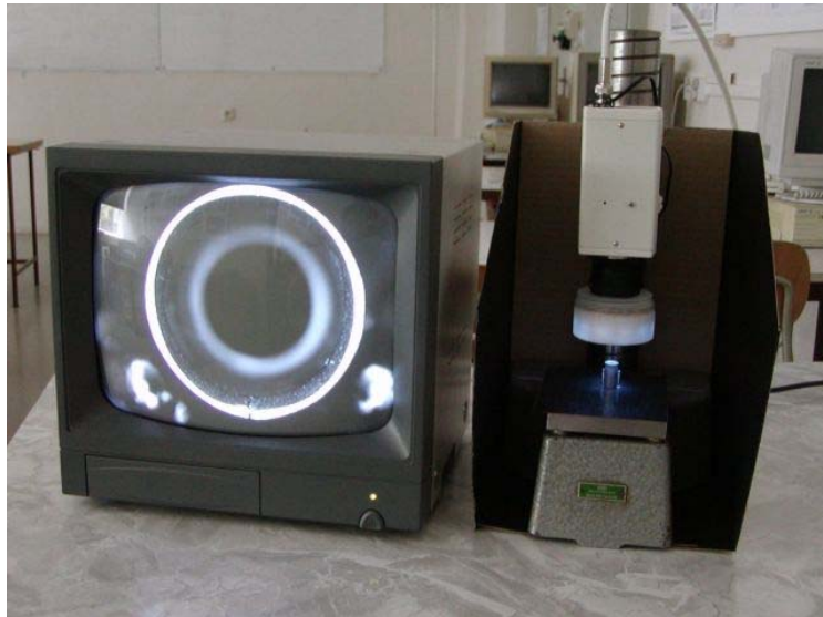
Figure 4. Workplace for automatic visual checking

Table has suitable light system. Twelve LED diodes with 3mm radius and wave length 568nm illuminate work piece. Diodes were attached directly into holder and placed on camera objective to illuminate work piece from top. Workplace was overshadowed by three walls to reduce day or room light.