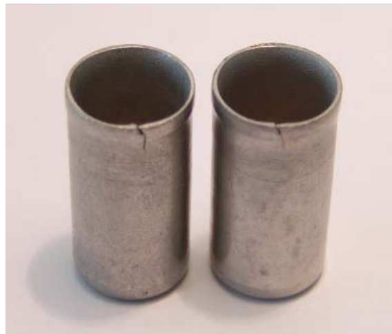
Figure 1. Cracks on products

Computer vision system with camera was developed for sight checking of strain cracking in check-out of socket block extrusions. They are made by deep cold pressing technology; the relationship of their depth to diameter is greater than 2 (diameter 10 mm, depth 22 mm). In production are cracks on about 5 % of parts - therefore their quality control is necessary (Figure 1).