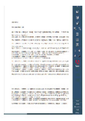
Figure 1. Book converted using Gymnast and read in Acrobat eBook Reader

The layout of the form is fairly simple and easy to understand, and it requires users to fill in some information regarding the document to be converted, which includes source files, document information, and page properties. Once finished, users can convert the file by choosing the conversion option in the "File" pull-down menu. To read the book, users have to launch the Acrobat eBook Reader. In our study, the document files used were successfully converted although some tables and figures appeared to be missing. Unlike Gymnast, Keebook Creator allows users to build books and view them within the same environment. When the program is launched, users are prompted with option to open an existing or a new project. If users opt for a new project, a dialogue wizard box is opened where users can provide information on the book title, author, and where to locate the book in the library book. Then users can start building books by creating chapters, inserting the source document files into chapters, and editing the table of contents. In our study, the book was successfully created without major problems.