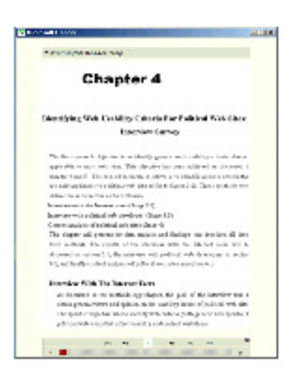
Figure 2. Book compiled in Microsoft Reader Works and read in Microsoft Reader

From this evaluation, we concluded that the best reader and compiler for inexperienced writers are Microsoft products (i.e. Microsoft ReaderWorks and Reader). This result informed an experiment to demonstrate how e-books can enhance interaction in distance education, as discussed in the next section.