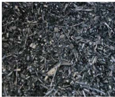
Figure 1. Chips of white bronze with charcoal

The most efficient method turned out to be method B where the efficiency reached 41% (Fig.5,6). Two packets of 400g each were added into the melt during remelting process. The similar method C was carried out with pre-heated packets and the addition of heavier packets (500g each) during remelting. These small changes in processing resulted in a decrease of efficiency to 31% probably due to longer heating time necessary to melt larger volume of material, and subsequently higher oxidization of the charge (Fig.7).