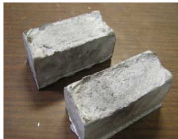
Figure 8. Lump waste for charge E, F