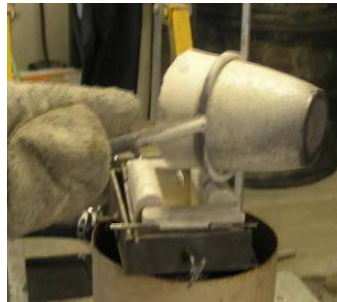
Figure 5. Casting of charge B