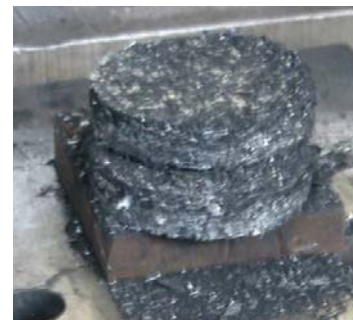
Figure 3. Packet of chips compacted with charcoal 1:6