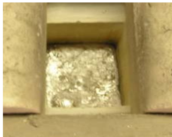
Figure 7. Result of Method C