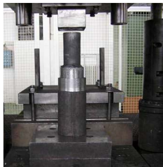
Figure 2. Compacting of packets on hydraulic press