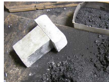
Figure 9. Result of Method E

Preheating temperature of the packets of 500°C was tried for method D. It was however impossible to manipulate the packets at this temperature because they became too brittle and had a tendency to fall in pieces. They were therefore cooled to room temperature and used as the base for melting bath of