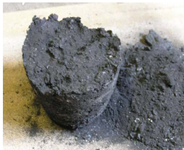
Figure 4. Result of Method A