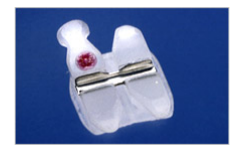
Fig.3. LFS used for the joining of bracket on a mouth brace [187]

Lead-free solder materials are used in the joining of bracket on a mouth brace, too [18], as shown in Fig.3. It involves an aluminum oxide stainless steel brazed connection. Silver-based alloys are mostly used for this purpose. Its main constituents are silver and titanium, while the other constituents present in lower extents are aluminum, cadmium, bismuth, phosphorous and silicon.