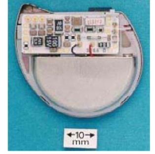
Figure 1. Current activities in lead-free soldering [8]