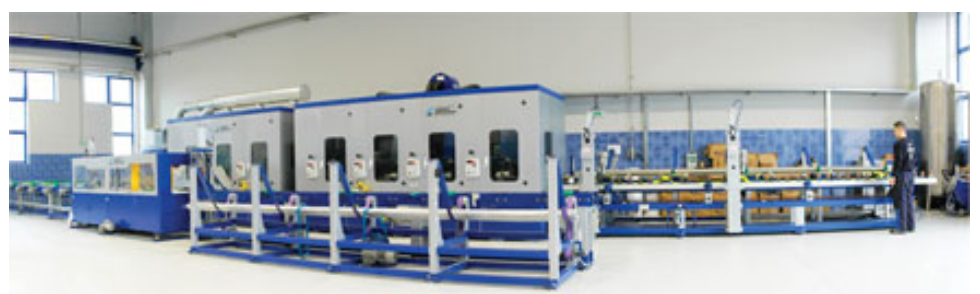
Figure 3. The entire machine for grinding and polishing of circular stainless steel tubes

The infeed is on the tube entrance into the machine, and it provides the entrance of the tubes 100mm - 6000mm long. Most commonly, 6000mm long tubes are utilized. The infeed is completely automatized and its maximum load is 2t, wherein the number of tubes it can receive depends on the diameters and thickness. The diameter of tubes varies between 10mm and 220mm.