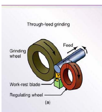
Figure 1. Schematic view of the mode of operation