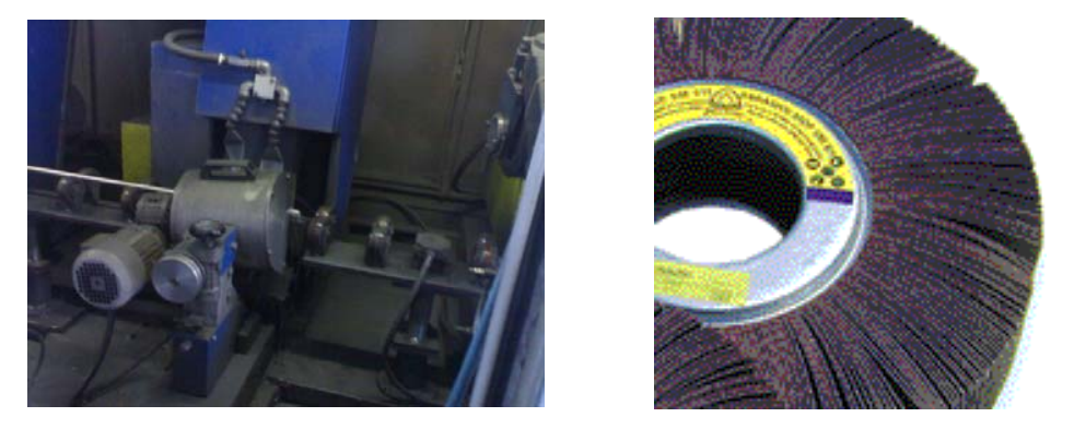
Figure 6. Interior of the PT 150 module (left)and polishing brushes (right)

Artificial materials, such as aluminium oxide, silicon carbide, cubic boron nitride and diamond are most commonly used for the production of grinding (abrasive) bands. For the different purposes, the ST 220 uses CBN (cubic boron nitride) and PCD (artificial diamond)-based bands produced by Klingspor .