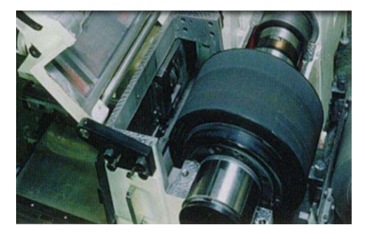
Figure 5. Grinding wheel inside the grinding module