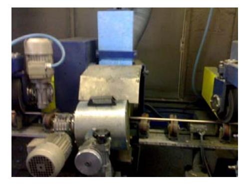
Figure 4. Interior of the ST220 module

The grinding modules ST 220 (Figures 4 and 5) are the first in the technological procedure of pipe grinding and polishing. All the grinding modules are identical, however the power within particular