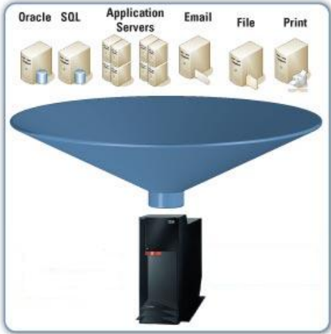
Figure 2. Multiple servers can be installed on single high availability hardware infrastructure decreasing initial and energy costs.

As the memory and processor usage in most of operative systems in business environments is constant in specific periods during the day, it is easy to plan whole system performance and interleaving of available resources and real hardware requirements in specific time slots.