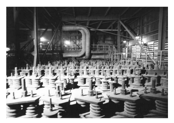
Figure 1. Elastic suspensions of boiler.

Improper load distribution in suspensions (Figure-1) is particularly dangerous in the corners of the boilers causing the increase of stress gradient. Leaks of screen pipes often appear in these places. The excessive bending of steam superheater collectors results from unequal load distribution (Figure-2) in the suspensions casing improper work of waterheater suspensions and noisy functioning of the second pass can be also observed. The reason of the phenomenon is usually vibrations caused by coils hitting against the boiler walls. Improper functioning of the parts working inside the boiler can be caused by displacement of a resultant force of gravity due to modernization. In that case entire object may incline causing its relative displacement with regard to the position of internal parts (e.g. waterheater, etc.) as well as external objects (boiler drum). Such a situation has been noticed when the weight of the front wall of the combustion chamber has been increased and the back wall of the 2nd pass has been unloaded as a result of the modernization. Tilt and torsion of the combustion chamber are further effects of improper functioning of the suspension or lack of their adjustment after modernization or major repairs.