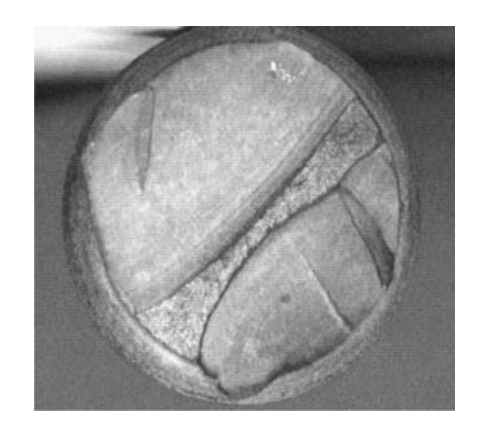
Figure 3. Fatigue failure of the suspension caused by vibrations.