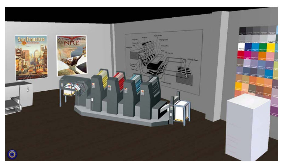
Figure 1. Virtual classroom VD-20

There are many X3D content-creation tools [11]. In this paper, X3D-Edit is used for the environment creation. X3D-Edit is a graphics file editor enabling simple error-free editing, authoring and validation of X3D scene-graph files. Base model, named "VD-20", is virtual representation of real classroom "D-20" as one of many classrooms intended for practical exercises in computer science (fig. 1).