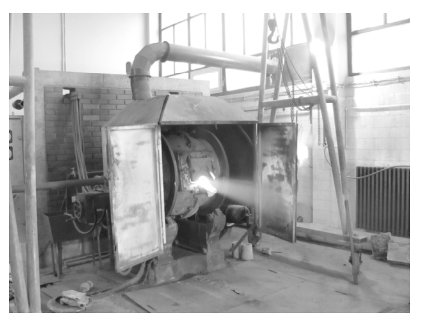
Figure 1. BIRLEC furnace for melting spent automobile catalyst

Melting has been performed in electric arc furnace (BIRLEC, maximum power 200kW) shown in Fig. 1. Pre-dried pellets are poured to the pre-melted copper which acts as a collector metal. Melting is carried out periodically by pouring slag out of the furnace which are later transported to the dump. The slag, if the process is properly carried out, poor in copper and precious metals (approximatly < 0.2 % of copper in slag). Platinum metals are due to its high affinity of copper collected in copper. After outpouring the slag from the furnace, the casting of copper anodes were performed. Casting is performed in steel molds. Cast anodes contain about 1% of precious metals. After cooling, the anodes goes to the electrolytical process, where cathode copper and sludge is obtained. Anode sludge contains approximately 20-25 % of platinum metals.