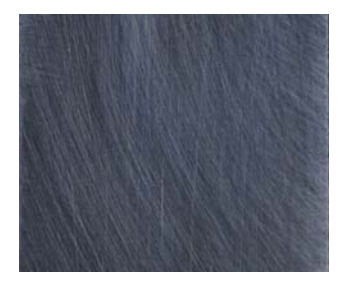
Figure 3. Magnified photographs (4x) of sample 2344-101: a) ground sample, b) polished sample