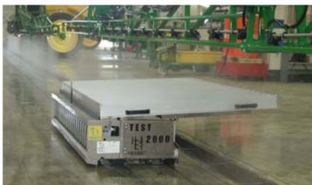
Figure 2. Mobile device for measuring the flow volume [4]

Such tests are carried out within the manufacturer's factory (Figure 2 and 3), and before the season using sprinklers mandatory testing should be performed, because the correctness and accuracy of one of the fundamental factors in the implementation of practices and agricultural production in general.