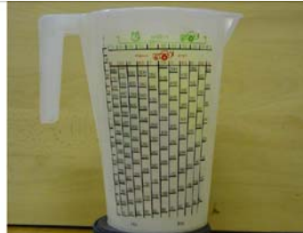
Figure 3. Cylinders used to measure the amount of flow in a nozzle

Operator has to be sure and to check all the mechanical parts for wear and to avoid troubleshoots of any faults. Most important parameters in the production of equipment is the uniformity of the nozzle, they must be cleaned and examined. Sprayers to be adjusted to the desired working pressure us in a certain unit of time (15, 30 or 60 seconds) to carry out testing nozzles capturing droplets in front of these containers, and to compare the results of all tested nozzles. In the event that the difference of water per nozzle is greater than 10%, nozzles should be replaced. Nozzles are supplies, subject to abrasion and wear, therefore, testing should be done always before the intensive use of sprinklers.