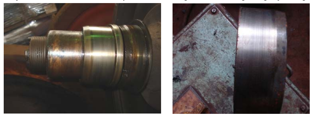
Figure 2. Damage deposit (sleeve), corrosion and etching Figure 3. The damaged surface and flaking

Corrosion and erosion leading to increased corrosion wear, which results in scarring. Corrosion of friction or corrosion circuit is created, but with a slight displacement between the inner ring and shaft sleeve and between the outer ring and housing (Fig. 2). [6] Loose assembly facilitates the movement of one part to another. Corrosion caused by wear of the bearing acts as a tool for grinding or polishing.