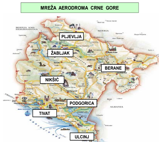
Figure 1. Existing airport network in Montenegro [9]

Small sport airports, equipped to accept airplanes, could provide many benefits to the local economy improvement. The realisation of this program would give a great chance to the local managements for increasing the investor interest based on the improved air traffic infrastructure.