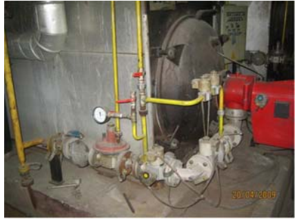
Figure 4. View on the old boiler

The boiler no 3 was dismantled and condensing boiler was installed. After dismantling, the wide area around the boiler was arranged. Preparations were made for mounting the new boiler, the connection to natural gas and electricity was then prepared. Instead of the existing chimney, the new chimney was placed and connected with the boiler. Underground flow-return pipeline was constructed of pre-insulated pipes and connected to the existing distribution pipes in the west MEF building. This pipeline was connected directly to the boiler. Circulating pump, three-way valve and expansion vessel were installed in the boiler house.