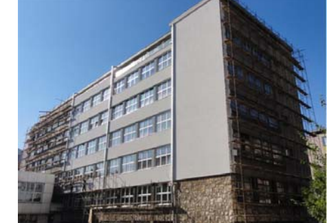
Figure 2. View on the west MEF building before