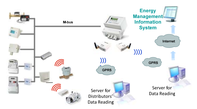
Figure 6. M&V System at the MEF in Sarajevo

6. Heat energy consumption (for radiator system of the west building , for radiator system of the east building and for air heating of the east building )