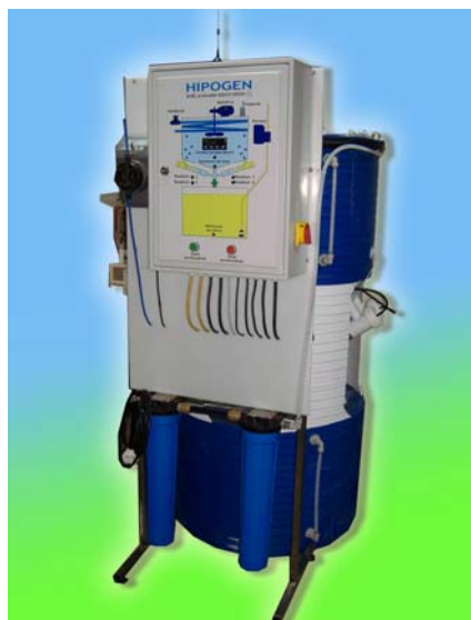
Figure 2. Picture of the modular charge electrochemical generator for automatic production and dosing disinfectants and with self cleaning electrodes

Among the capacities given in this brochure, we can produce our system which can satisfy much higher needs for equivalent chlorine, up to 10 kg per day. Such system comprises all other elements except the reactor tank and hypochlorite storage tank, which are too big and must be placed separately.