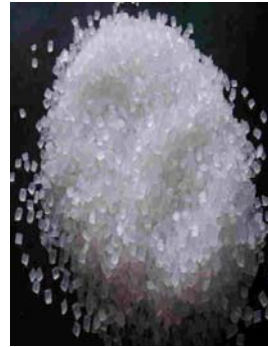
Figure 2. Polypropylene (PP)

The specifications of conveyor was used in test is given in Table 1. The experiments were performed for different angle.