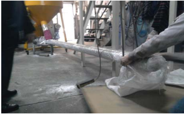
Figure 1. The screw conveyor