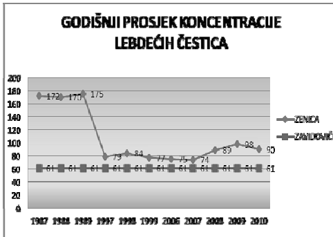
Figure 1. Year average of airborne particles