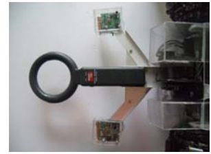
Figure 3. ‘Moving hand’ set