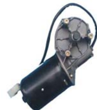
Figure 6. DC motor

In any motor, torque is the result of the force between two magnetic fields and is proportional to the amount of current flowing through the motor.