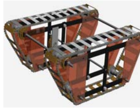
Figure 2. Skeleton