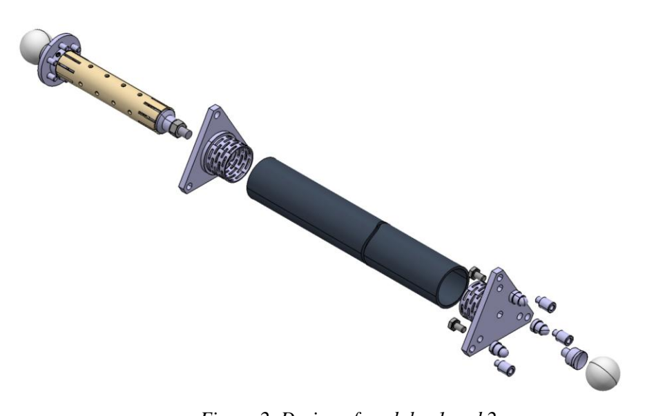
Figure 2. Design of modules 1 and 2

Detailed design of modules 1 and 2 is shown in Figure 2.