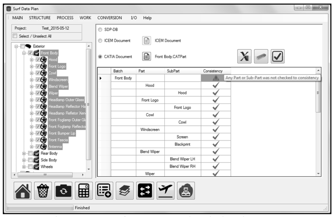
Figure 3. KBD application prototype for automotive styling checking the consistency using RDBMS.

example can be run on a server to connect several clients to a common database. In particular, Figure 3 shows on the right side the result of a data quality checking procedure for the preselected elements of the structure on the left side. Several results can be stored on a centralized relational database and thus shared with other designers or monitored by project engineers for example.