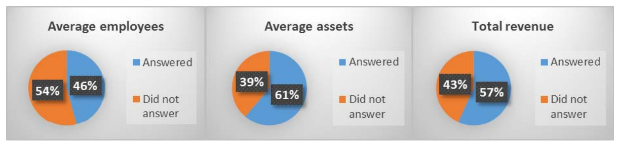
Figure 1. Significance analysis of samples

Answers were in accordance with criteria for setting substantiality of sample structure regard that of total sum of collected answers in absolute numbers percentage represents over 50% of stake in parameters of average assets and total revenue, while parameter of number of employees was represented with just under 46% (see figure 1):