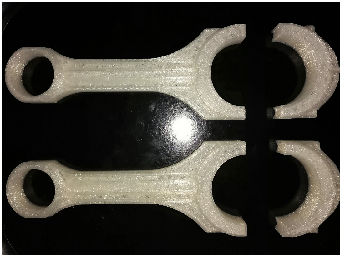
Figure 3. Model of engine parts printed for exercise.

Figure 3 shows the printed model of the piston and the piston rod of the motor 6DGRA18/22. The CAD is performed in Autodesk Inventor Professional 2015.